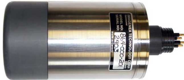
Model shown is 3000 m depth rated

The Imagenex Model 864 is a completely self-contained altimeter with a digital input/output. This unit is compatible with the Model 881A switch data command and return data formats. This unit is mounted in a pressure proof housing with an underwater connector for use at depth. The 864 Altimeter measures the range to the bottom or other large objects. It requires only power and an RS-485 or RS-232 serial interface to an external device.