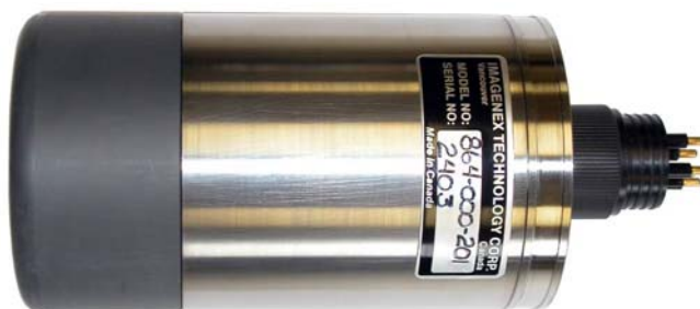
Model shown is 3000 m depth rated

The Imagenex Model 864 is a completely self-contained altimeter with a digital input/output. This unit is compatible with the Model 881A switch data command and return data formats. This unit is mounted in a pressure proof housing with an underwater connector for use at depth. The 864 Altimeter measures the range to the bottom or other large objects. It requires only power and an RS-485 or RS-232 serial interface to an external device.