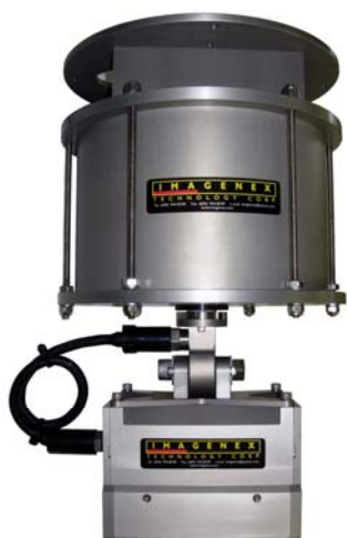
Imagenex Model 837B Profiling Sonar (Model 837B-000-431) not included