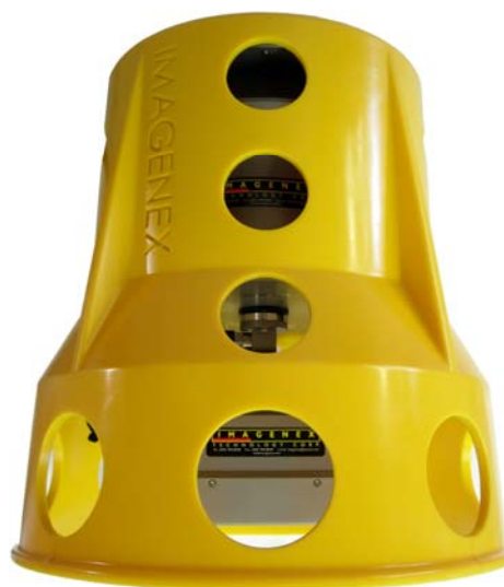
Shown with optional P/U Protective Cover

The Model 837 Delta T Azimuth Drive is a rugged and powerful rotary actuator drive that can be coupled to an Imagenex Model 837 or 837B Delta T Multibeam Profiling Sonar. The two axes of rotation in this combined unit provide the capability to obtain accurate, high resolution range information in any direction. In standard applications, profiles may be made in any direction by simply commanding the Azimuth Drive to rotate the attached profiling sonar anywhere in a circle. The profiling sonar can then perform a cross-sectional scan before being rotated to a new azimuth angle. The Azimuth Drive uses the same Ethernet communications line and command structure as the Delta T head. A single, simple to use PC compatible computer program operates both.